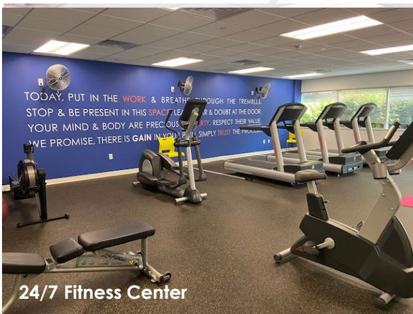
24/7 Fitness Center