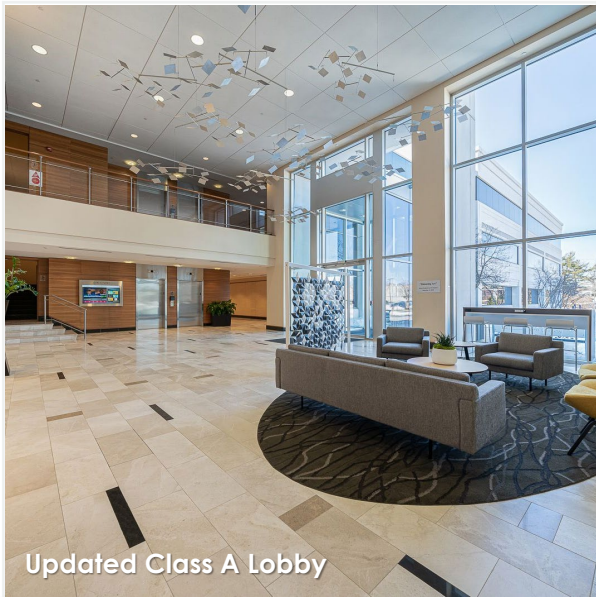
Updated Class A Lobby