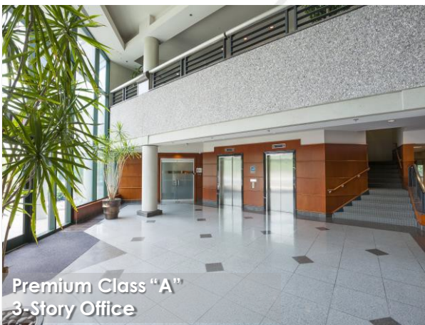
Premium Class "A" 3-Story Office