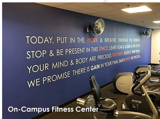
On-Campus Fitness Center