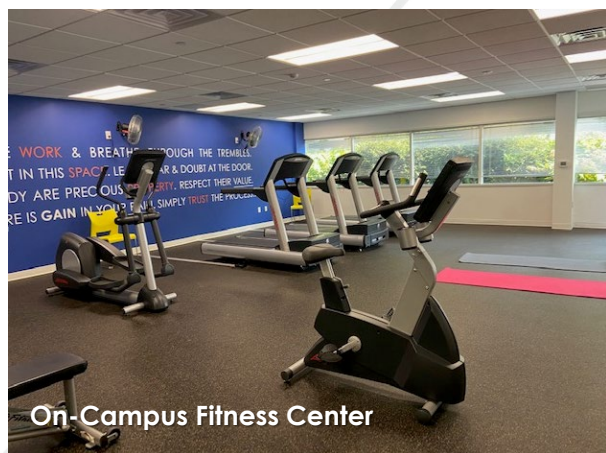
On-Campus Fitness Center