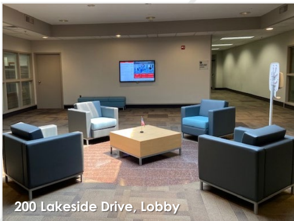
200 Lakeside Drive, Lobby