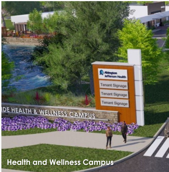
Health and Wellness Campus

WSPT is a privately held, vertically integrated, full-service commercial real estate company specializing in the ownership, management, leasing, and development of Office, and Industrial / R&D / Flex (IRDF) spaces. Workspace owns and operates approximately 18 million square feet across over 200 properties in sought-after markets, including 13 of the top 20 US metropolitan areas.