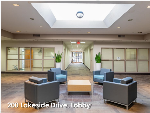
200 Lakeside Drive, Lobby