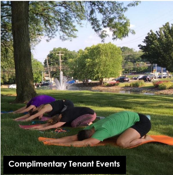
Complimentary Tenant Events