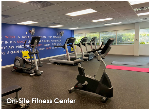
On-Site Fitness Center