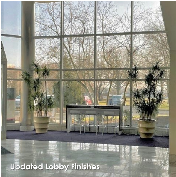
Updated Lobby Finishes