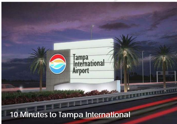
10 Minutes to Tampa International