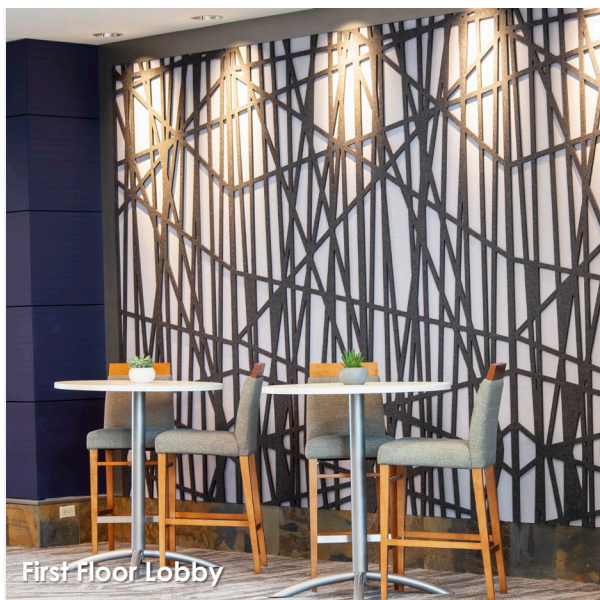
First Floor Lobby