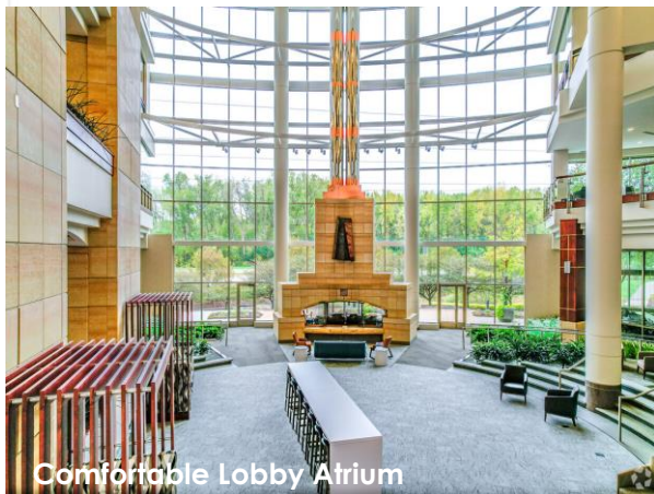
Comfortable Lobby Atrium