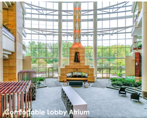
Comfortable Lobby Atrium

Workspace Property Trust is a privately held, vertically integrated, full-service commercial real estate company specializing in the ownership, management, leasing, and development of Office, and Industrial / R&D / Flex (IRDF) spaces. Workspace owns and operates approximately 18 million square feet across over 200 properties in sought-after markets, including 13 of the top 20 US metropolitan areas.