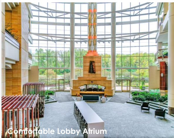
Comfortable Lobby Atrium