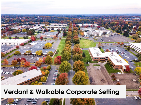
Verdant & Walkable Corporate Setting