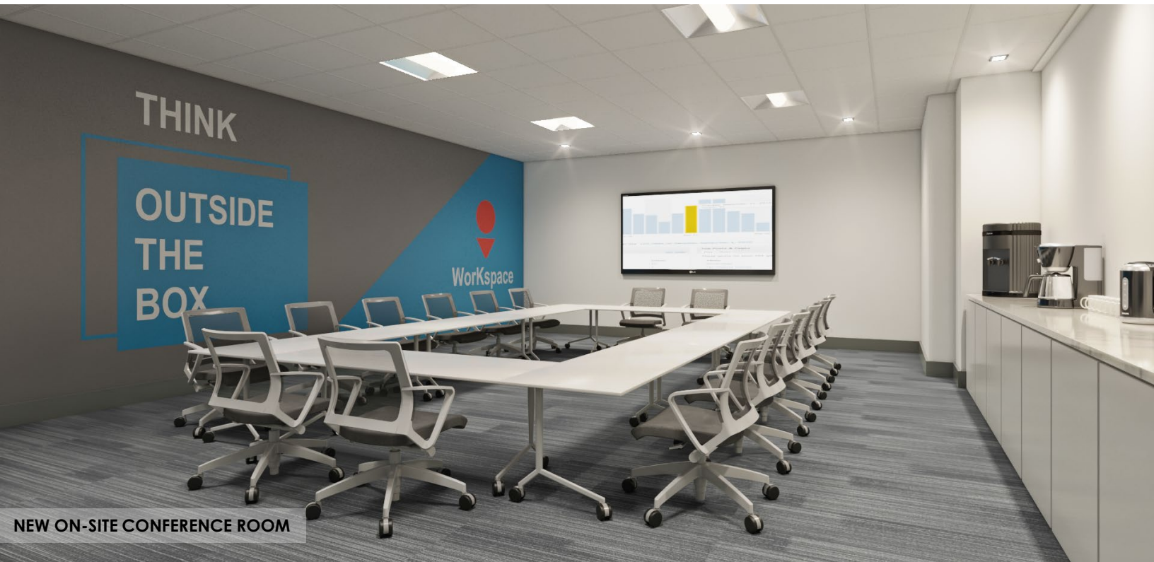
NEW ON-SITE CONFERENCE ROOM