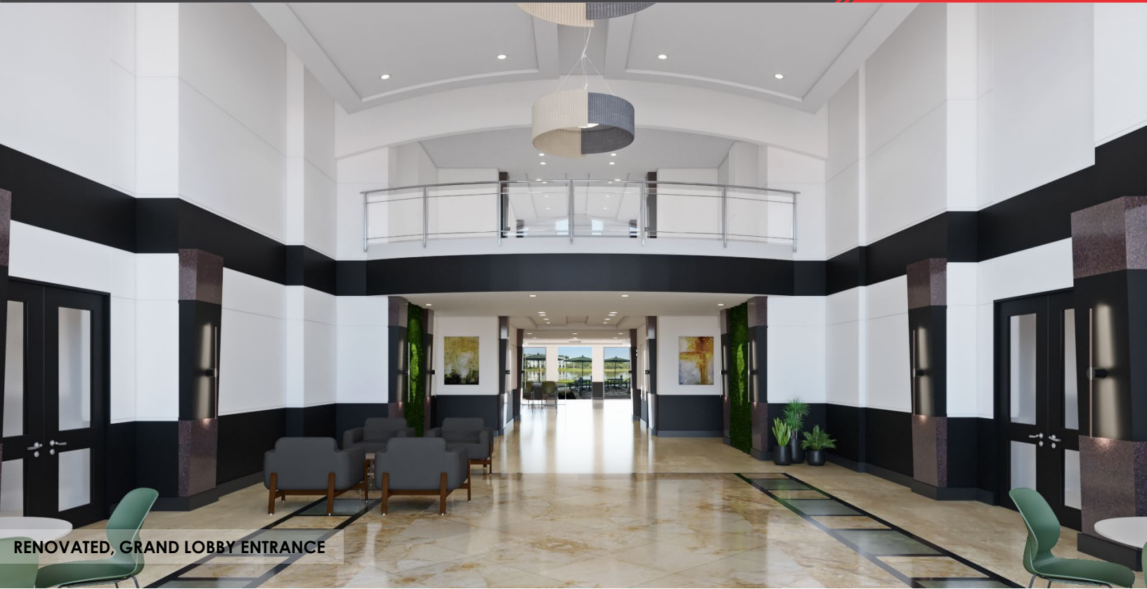
RENOVATED, GRAND LOBBY ENTRANCE