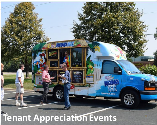
Tenant Appreciation Events