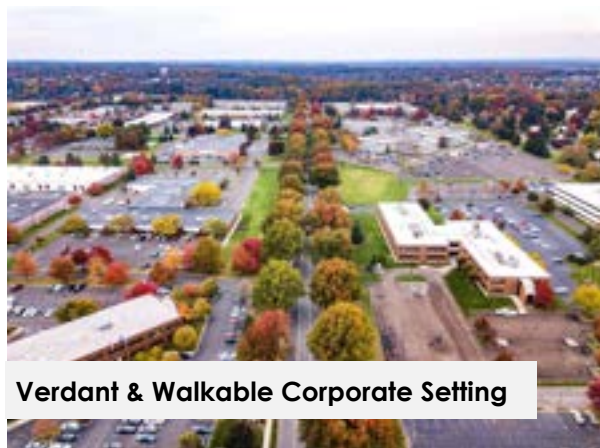
Verdant & Walkable Corporate Setting