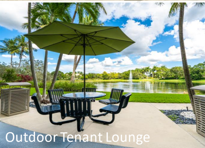
Outdoor Tenant Lounge