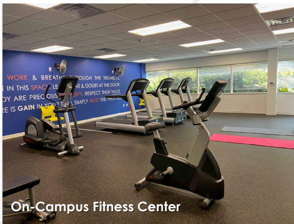
On-Campus Fitness Center