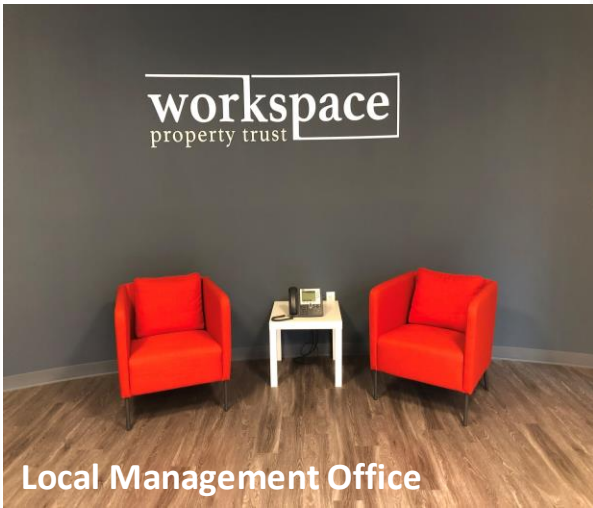
Local Management Office