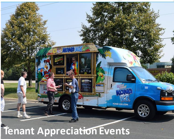
Tenant Appreciation Events