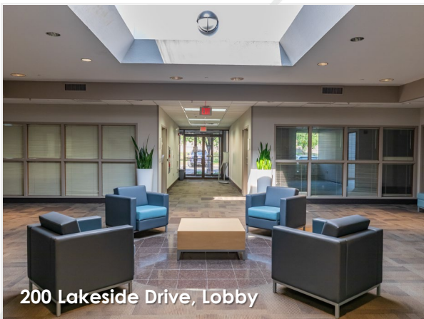
200 Lakeside Drive, Lobby