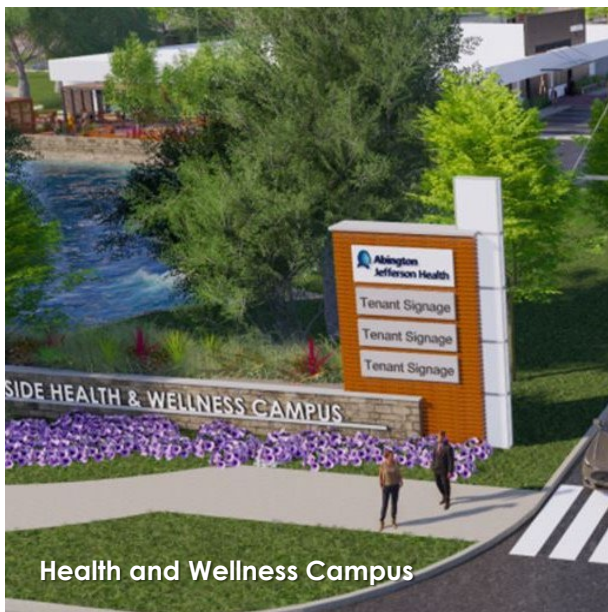
Health and Wellness Campus

WSPT is a privately held, vertically integrated, full-service commercial real estate company specializing in the ownership, management, leasing, and development of Office, and Industrial / R&D / Flex (IRDF) spaces. Workspace owns and operates approximately 18 million square feet across over 200 properties in sought-after markets, including 13 of the top 20 US metropolitan areas.