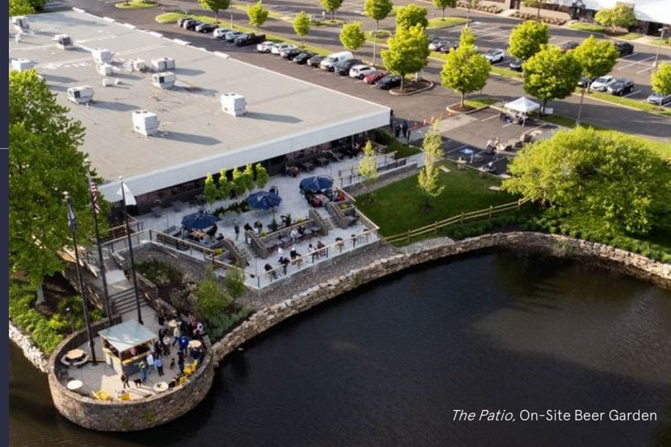
The Patio , On-Site Beer Garden