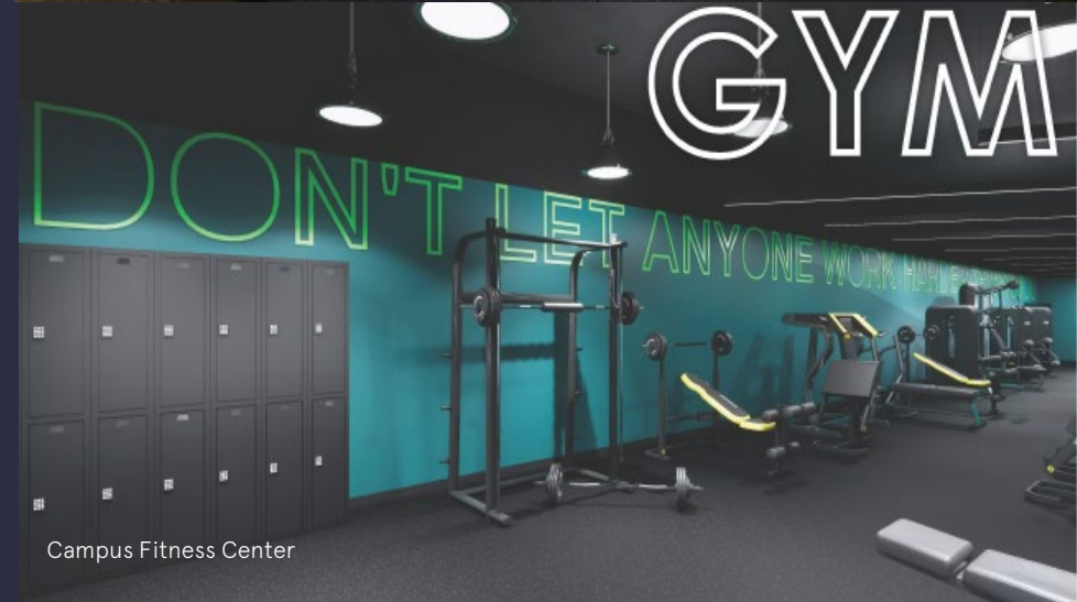
Campus Fitness Center