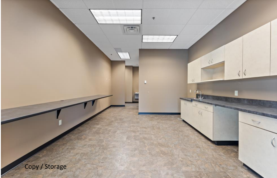
Copy / Storage