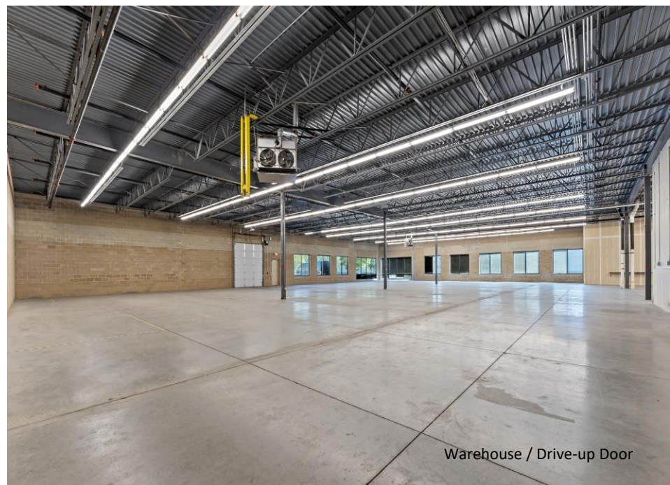
Warehouse / Drive-up Door