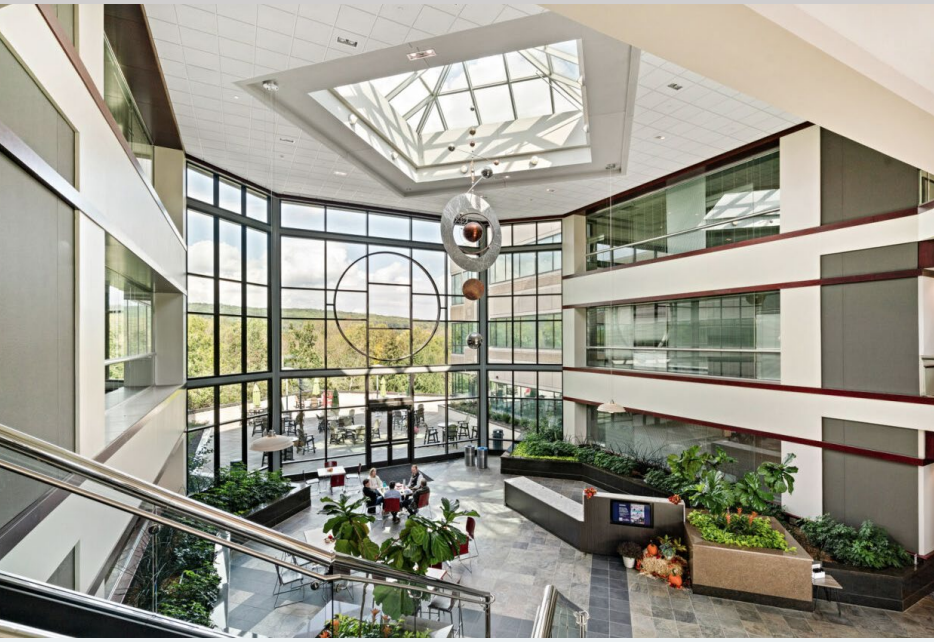
35,349 SF Available for Lease