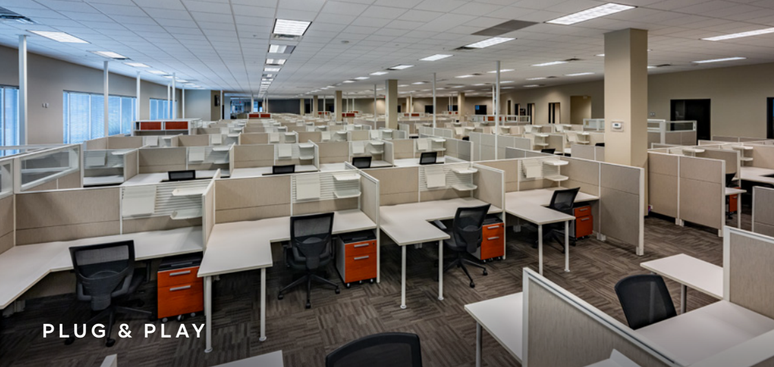
PLUG & PLAY