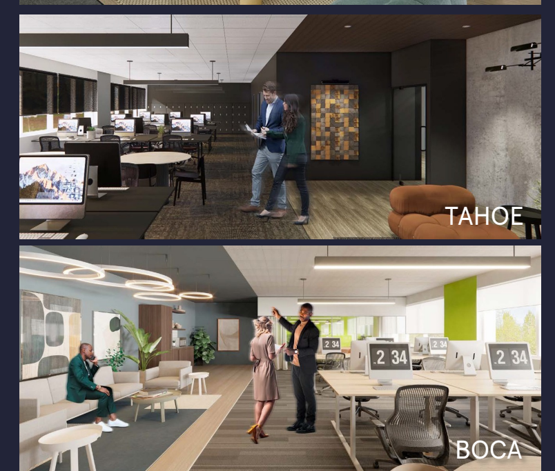
*Indicative of the look and feel (not the actual suite)