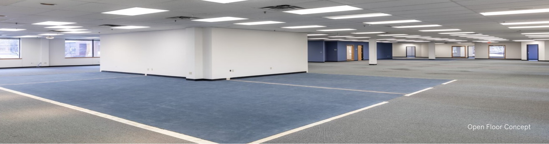
Open Floor Concept