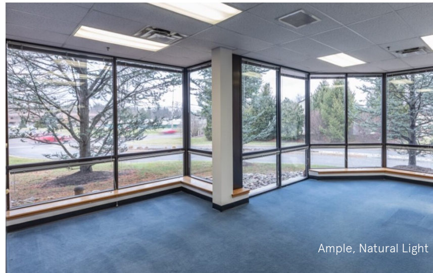
Ample, Natural Light