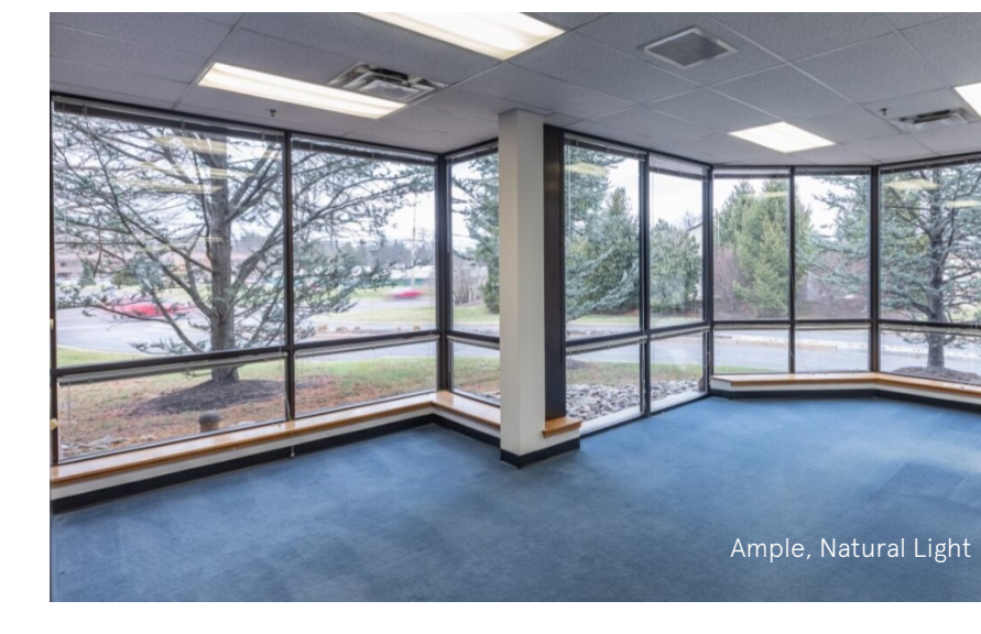
3,612 SF Available Now