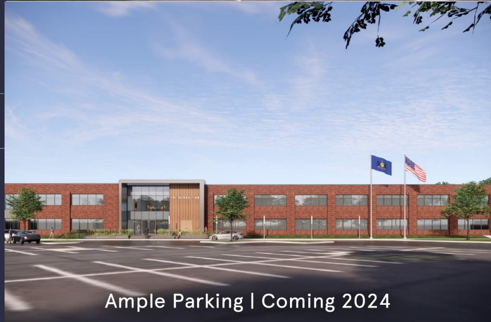
Ample Parking | Coming 2024