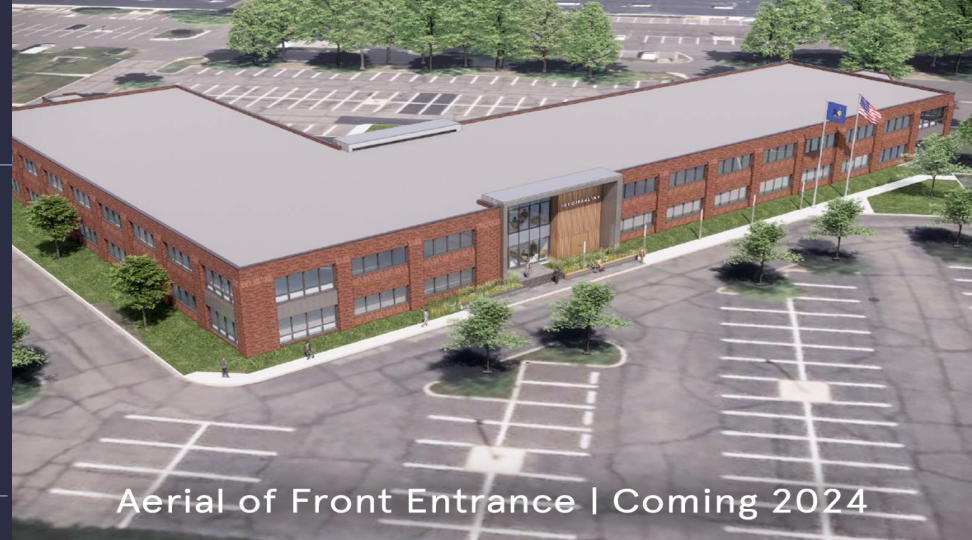
Aerial of Front Entrance | Coming 2024