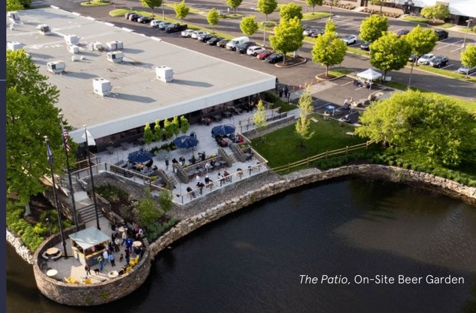
The Patio, On-Site Beer Garden