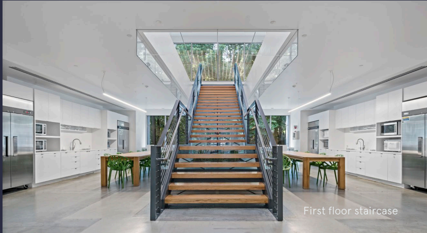
First floor staircase