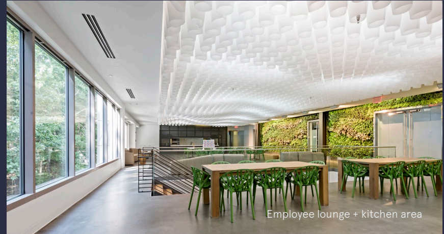
Employee lounge + kitchen area