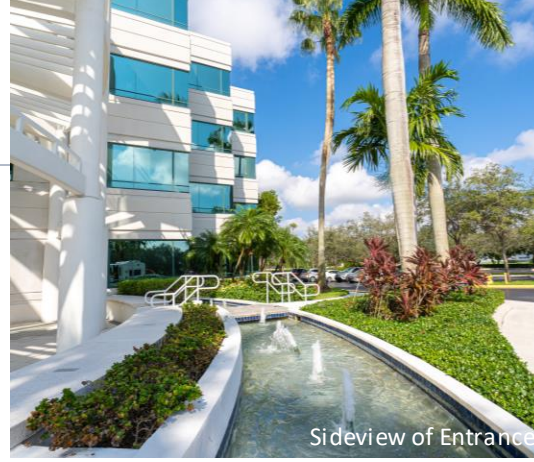
Sideview of Entrance