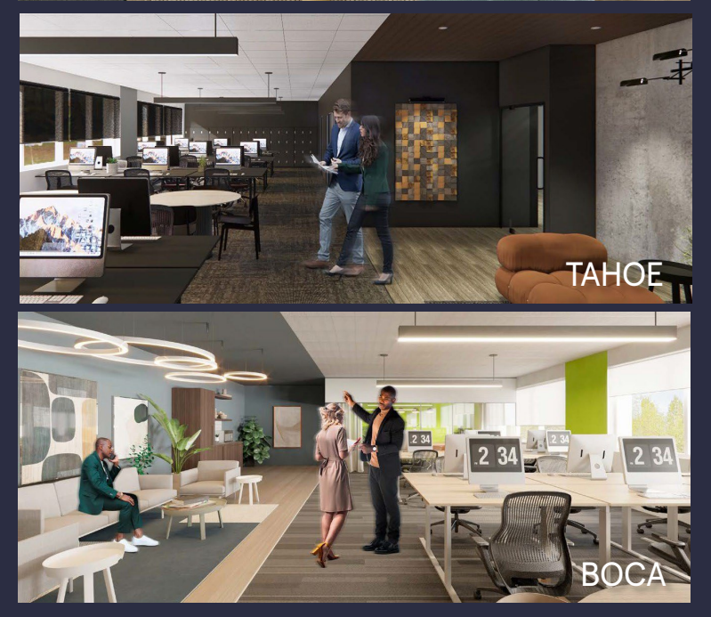
*Indicative of the look and feel (not the actual suite)