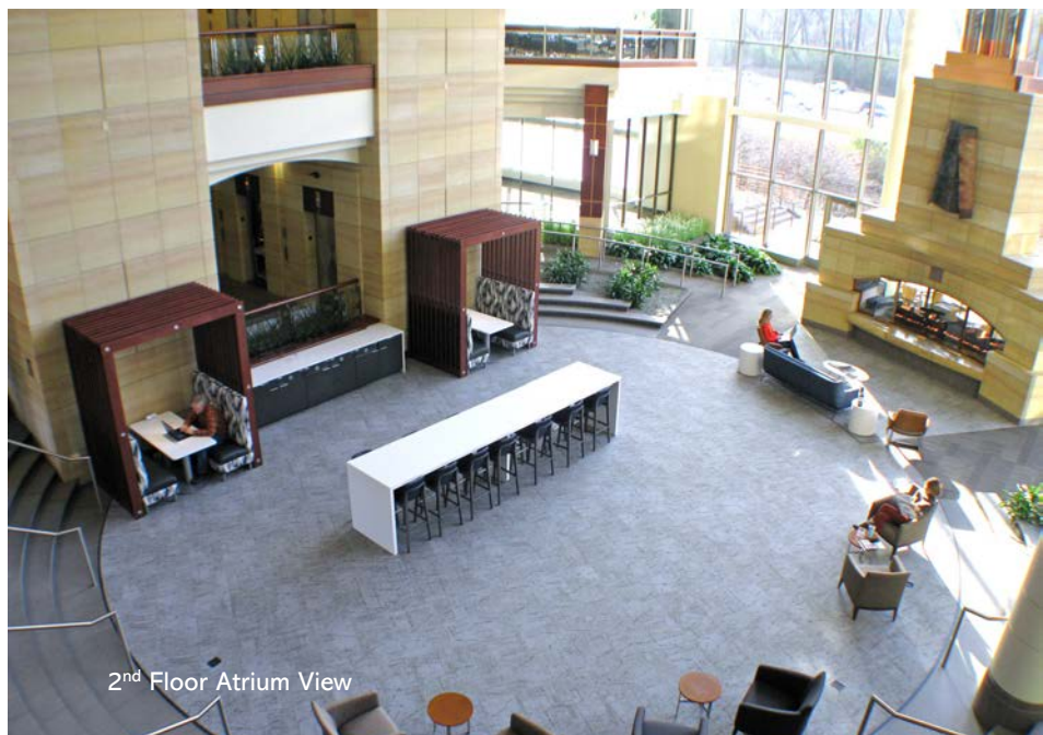
2 nd Floor Atrium View