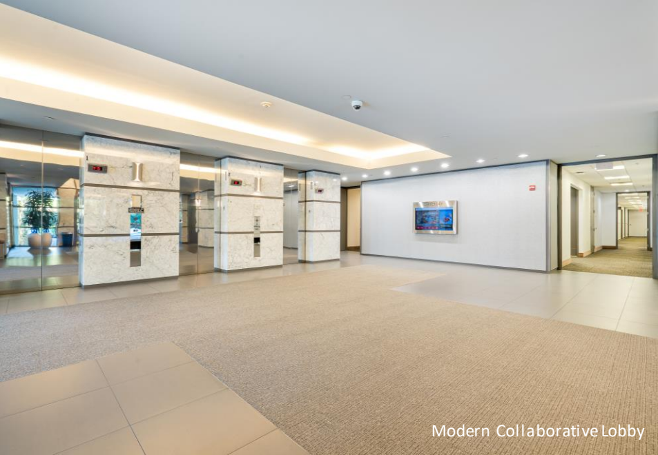
Modern Collaborative Lobby