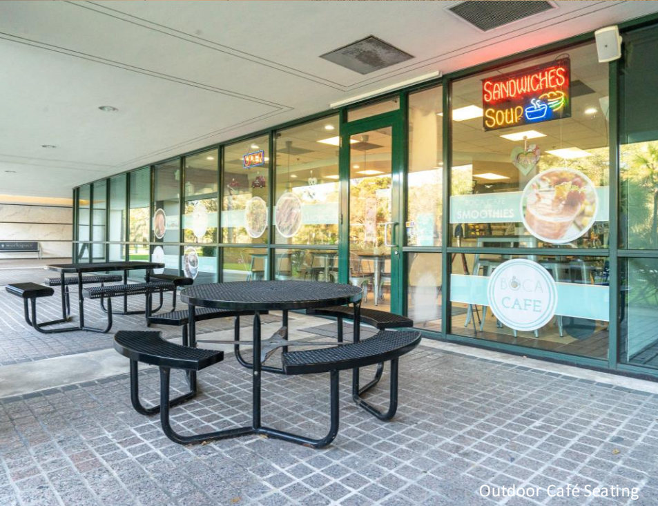
Outdoor Café Seating