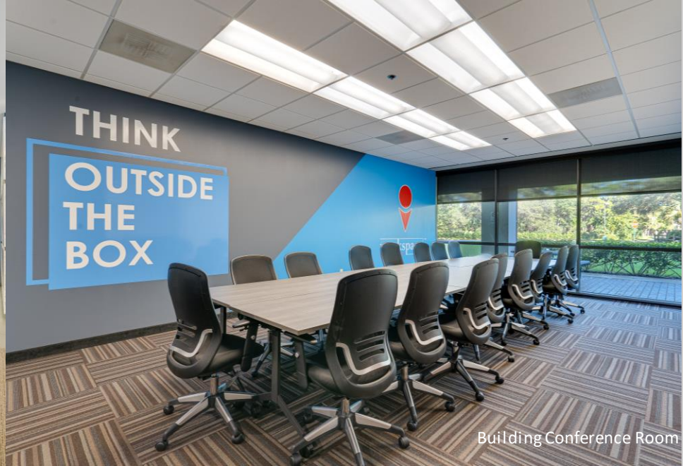
Building Conference Room