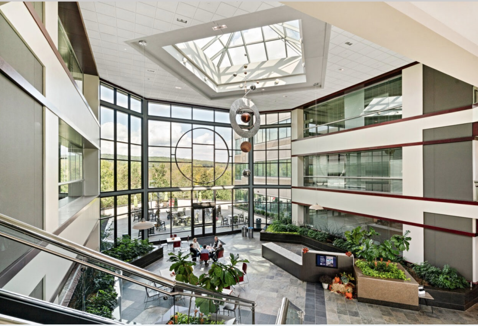
36,380 SF Available for Lease