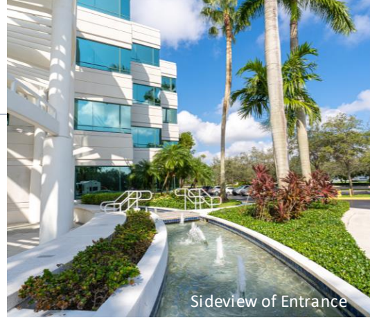
Sideview of Entrance