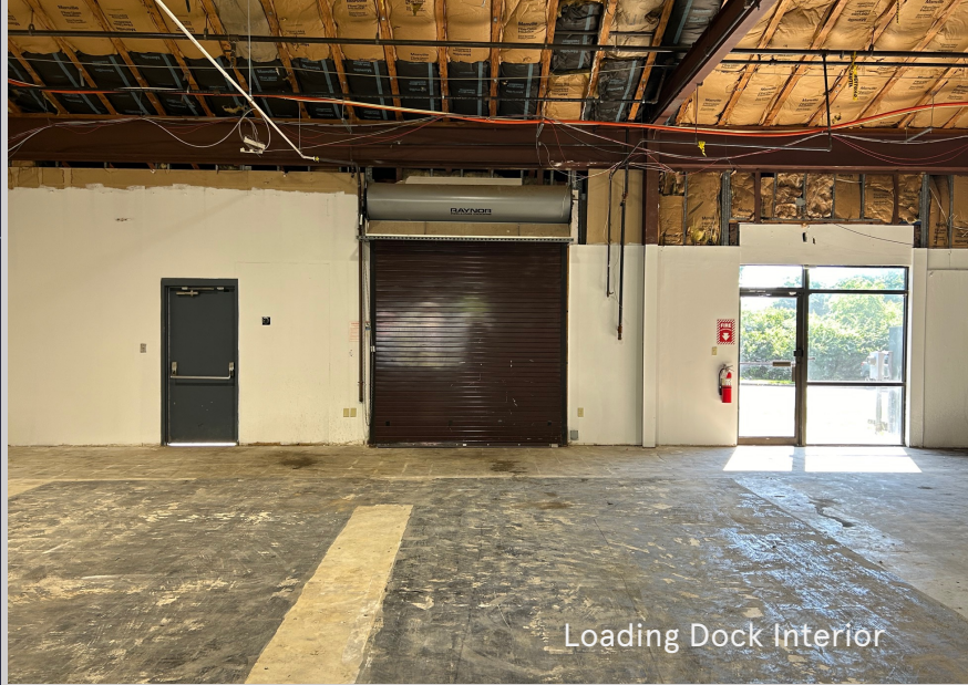
Loading Dock Interior

Features: Direct entrance, and individualized HVAC & electric