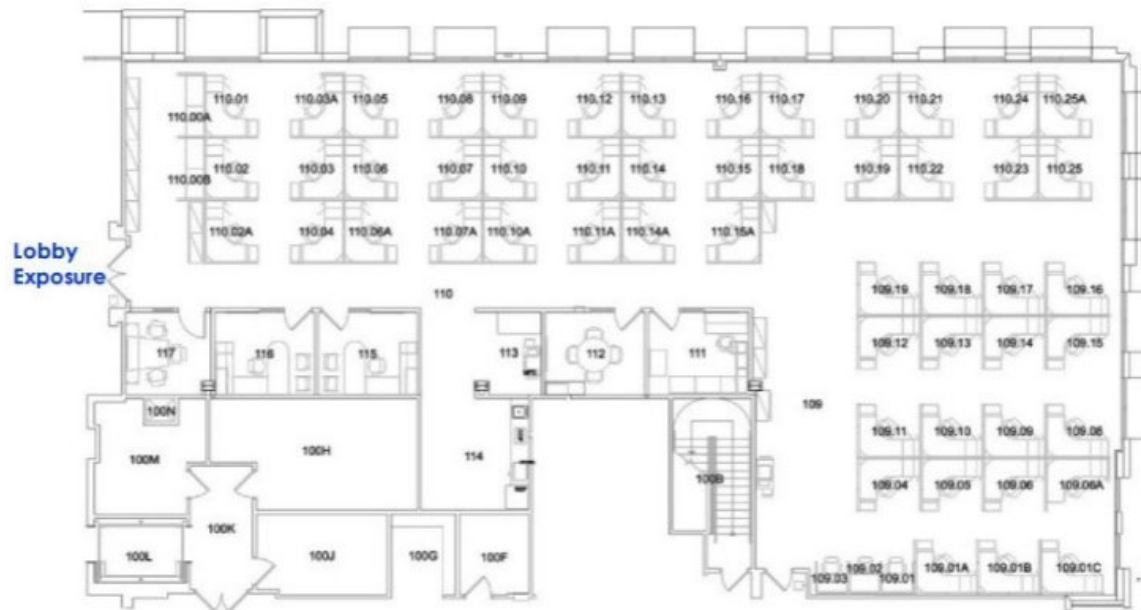
Suite 110 Ground Floor Lobby Exposure