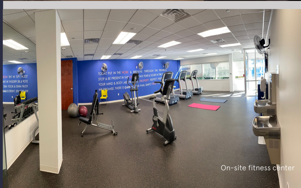
On-site fitness center