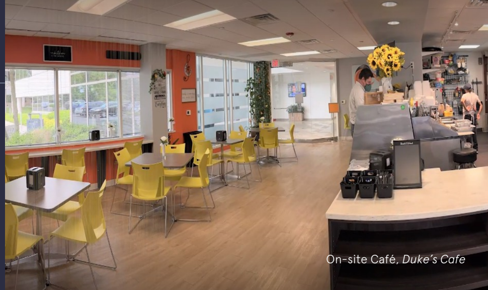
On-site Café, Duke's Cafe