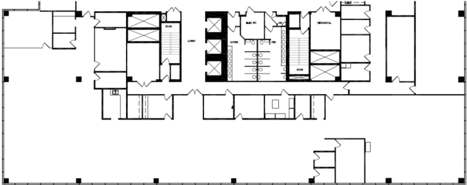
Elevator Landing Exposure