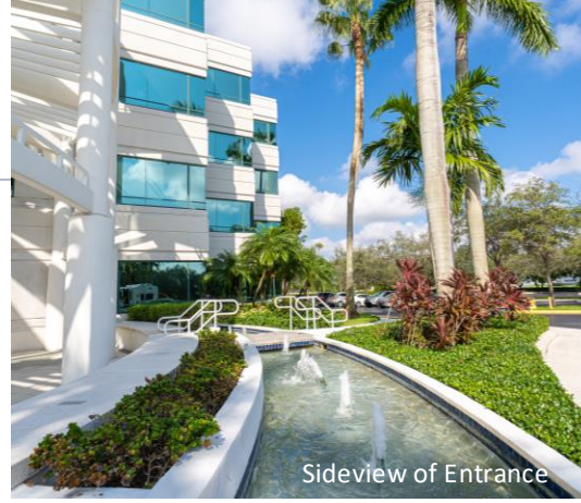
Sideview of Entrance