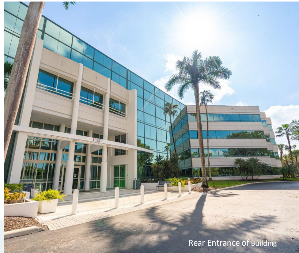
Rear Entrance of Building