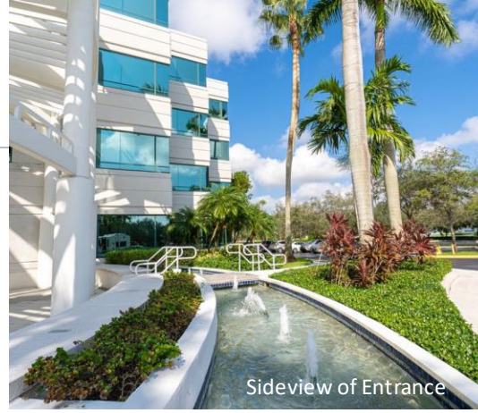
Sideview of Entrance