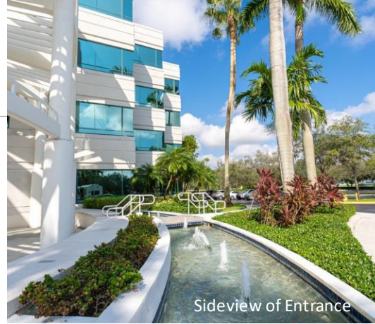
Sideview of Entrance