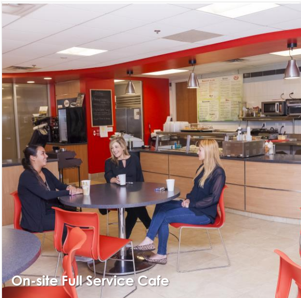
On-site Full Service Cafe