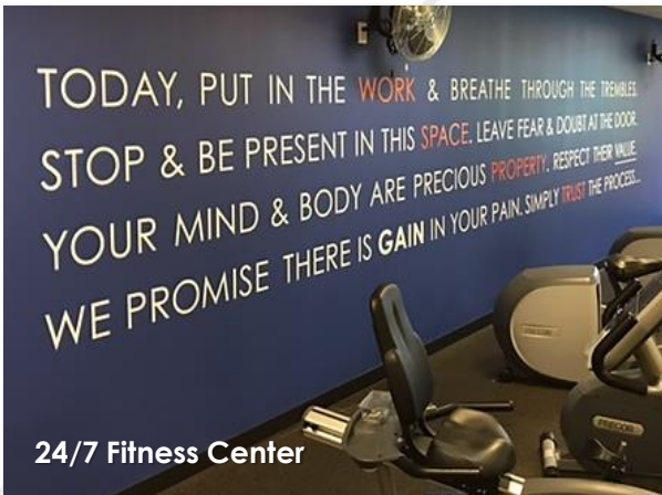
24/7 Fitness Center