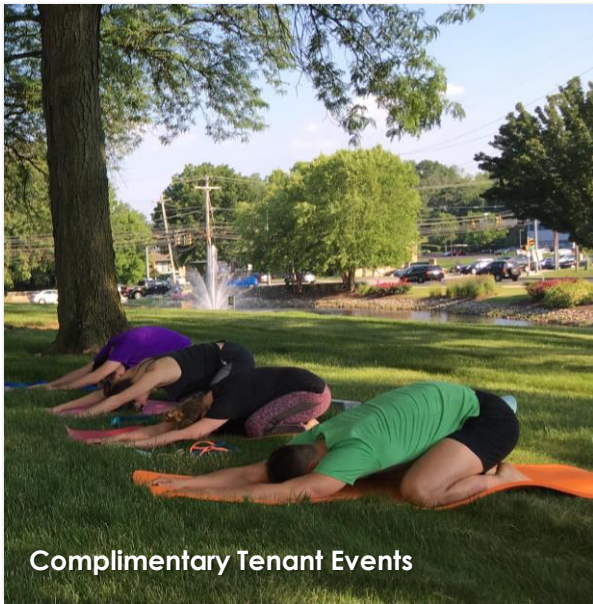
Complimentary Tenant Events

Workspace Property Trust locally owns, manages and leases 40 buildings consisting of over 2.3 million square feet of office and office-flex properties as a First-Class corporate campus.