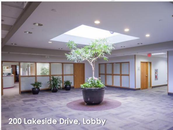
200 Lakeside Drive, Lobby