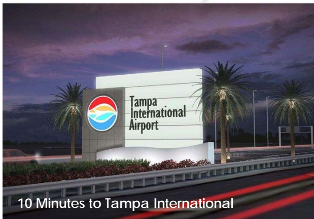
10 Minutes to Tampa International

Locally owns, manages, and leases 41 buildings consisting of 1.8 million square feet of office and light industrial properties in 5 business parks. The Tampa West Portfolio includes Woodland Corporate Center and Northport, while the Tampa East Portfolio includes Legacy Park, Silo Bend, and Crosspointe I and II.