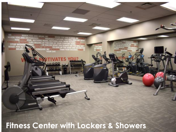
Fitness Center with Lockers & Showers