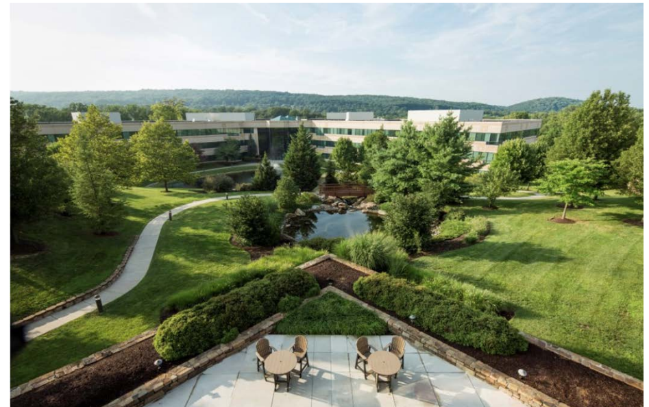
Outdoor courtyard and walking path to 1200 & 1400 Liberty Ridge Drive